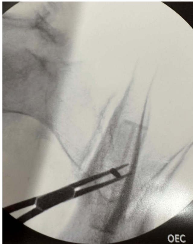
Figure 3 Diagram displaying bone marrow aspiration. Fluoroscopic imaging of the posterior iliac crest with the Jamshidi needle. A hammer is used to gently penetrate the cortex of the iliac crest prior to aspiration.