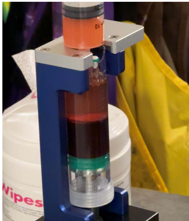
Figure 4 Processing of bone marrow aspirate to create bone marrow aspirate concentrate. Note the three fractions of the bone marrow aspirate after centrifugation. The fraction of interest is in the middle buffy coat directly above the dark red blood cells.