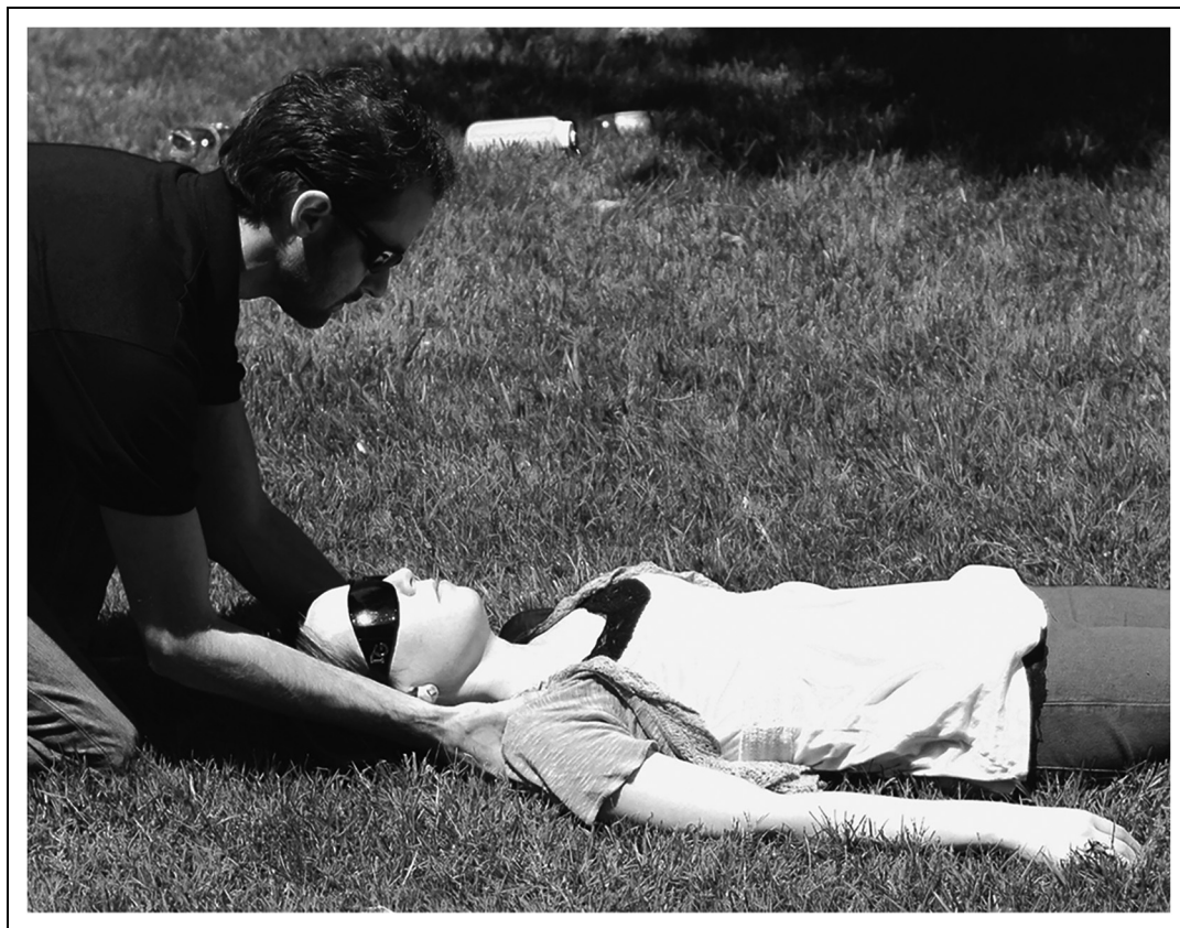
Figure 1. Demonstration of trap squeeze technique for manual cervical spine stabilization. (Quinn et al. 2)

Recommendation: We recommend the lift and slide transfer with trap squeeze to the log-roll when transferring patients if motion restriction is desired. In the case of facial fractures, an unconscious patient, or other scenarios concerning for airway compromise, the lateral position may be considered. Light to moderate traction (less than 69 kg) should be used when returning a cervical spine to the anatomic position and transferring a patient. Strong recommendation, low-quality evidence.